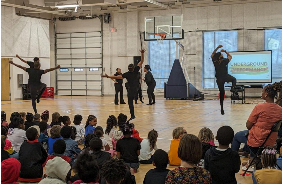
Members of Storling Dance Theater performed an excerpt from The Underground.