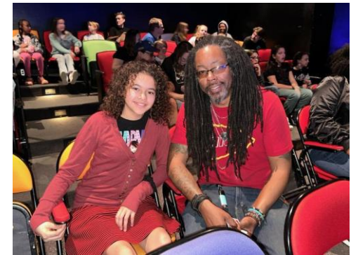
Families enjoyed Lightning Thief at the Coterie Theater on March 2